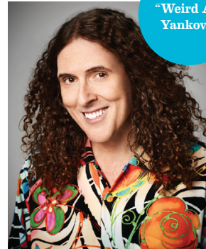
"Weird Al" Yankovic

Two years ago, EXHIBIT COLUMBUS attracted attention from around the world, with visitors descending on the Southern Indiana city to see what happens when world-class architecture interacts with innovative artists. (It helped that the indie flick Columbus was also bringing attention to Indiana's design showplace.) This time