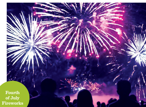
Fourth of July Fireworks

One of the lesser-known Hoosier sports movies, 2001's Madison , put actor Jim Caviezel at the controls of a speedboat at the MADISON REGATTA . The real deal, though, is certainly louder and can be more dramatic than anything Hollywood screenwriters could