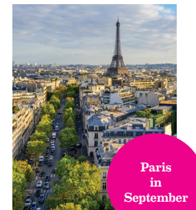
Paris in September

It's the end of a (two-year) era—one more BRICKYARD 400 in September before the race returns to its July slot next year. More patriotic, maybe, but the Speedway had tried the switch because sweltering weather caused fan complaints and, maybe, the slip in attendance. So enjoy the cars in the (kind of) cooler weather one last time. indianapolismotorspeedway.com