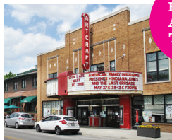
Historic Artcraft Theatre

the charming Historic Artcraft Theatre in Franklin screens a family flick, from Kung Fu Panda to Bon Voyage , Charlie Brown . A $5 ticket also gets you a popcorn and soda. historicartcrafttheatre.org