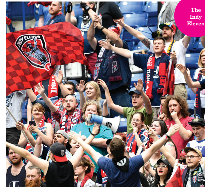
The Indy Eleven